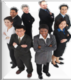
The Right Team